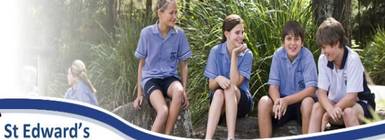
St Edward's Catholic Primary School, Daisy Hill

Last Friday Year 1 White presented a very thoughtful and engaging Assembly on Harmony. Their presentation challenged the school to reflect on how we practise harmony in our daily interactions, how we welcome, include, show compassion, celebrate diversity and difference. Thank you to all who supported the day with the wearing of Orange.