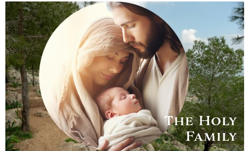
THE HOLY FAMILY