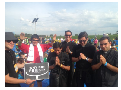
Description for photo 2:

The QLD St Vincent de Paul WYD pilgrims at the crypt Frédéric Ozanam, in Paris, France.