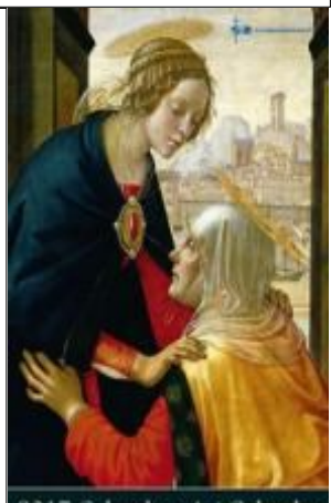
2017 Columban Art Calendar

Available from the Parish Office or SVDP Store.