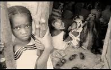
Joseph got up and took the young child and his mother by night, and fled to Egypt. - Matthew 2:14

underdeveloped countries rather than in developed countries such as Australia. The top six refugee hosting countries in the world are: Turkey, Pakistan, Lebanon, Iran, Ethiopia and Jordan." SHAME on developed countries! Australia has a total refugee and humanitarian program of 13,750 of which 6000 places are reserved for UNHCR referred refugees. Of the remaining 7500 places available each year, 2750 are set aside for onshore protection visas, the other 5000 places are for offshore and special humanitarian program e.g. refugees from Syria. With these statistics it is ridiculous to speak about a queue, There is no queue, it's a lottery that only very few win. Refugees get on a boat because it raises their chance of resettlement from NOTHING to SOMETHING. Next week we will look at how processing works in Australia. In the meantime let us make every effort to alleviate their suffering by welcoming the refugee/asylum seeker to our country.