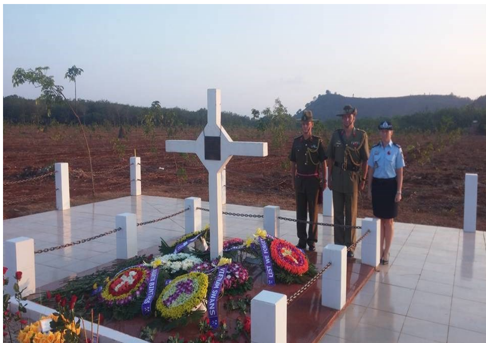
Long Tan Cross Vietnam; Memorial erected by 6 th Battalion, Royal Australian Regiment on 18 August 1969

18 August 1966 Phuoc Tuy Province, South Vietnam