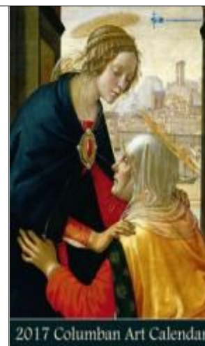
2017 Columban Art Calendar

Available from the Parish Office or SVDP Store.