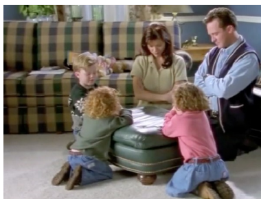
IT IS A WISE AND TRUE MAXIM THAT FAMILIES THAT KNEEL TOGETHER STAND UPRIGHT BEFORE THE LORD! - EZRA TAFT BENSON

The month of October is the month of the Rosary, one of the great community/family prayers of the Catholic church. I have fond childhood memories of gathering as a family each evening to recite the rosary. Unfortunately this custom is rapidly dying out in my homeland. It is a wonderful prayer that tells the story of the new Testament. Through the beads we follow the life of Mary and Jesus. We follow Mary from the day the Archangel Gabriel came to ask her to become the mother of Christ to the day she was crowned Queen of Heaven. We follow Jesus from the moment the Holy Spirit came down to Mary, through his childhood, his public life, his cruel death on the cross, the joy of Easter when he rose from the dead to the day he ascended to Heaven in glory. In the traditional rosary there are fifteen mysteries, however I recently discovered that in October 2002 Pope John Paul II added the "Mysteries of Light". These are: Christ's Baptism; Christ's revelation at the marriage of Cana; Christ's Proclamation of the Kingdom of God and call to conversion; Christ's Transfiguration; and Christ's Institution of the Eucharist. Let us pray the rosary this month for world peace.