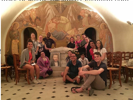
Description for photo 1: The QLD St Vincent de Paul WYD pilgrims at the crypt of Frédéric Ozanam, in Paris, France.