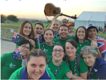
Description for photo 3: Vincentian youth days in Piekary prior to World Youth Day in Krakow with the Vincentian youth from around the world.