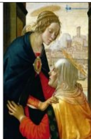
2017 Columban Art Calendar

Available from the Parish Office or SVDP Store.